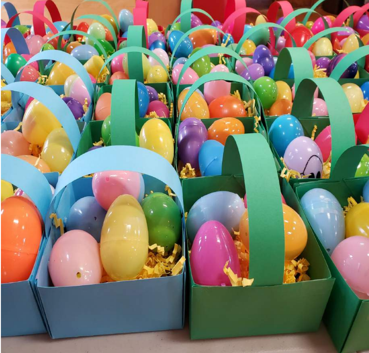
Children's Easter baskets for Spring Fling